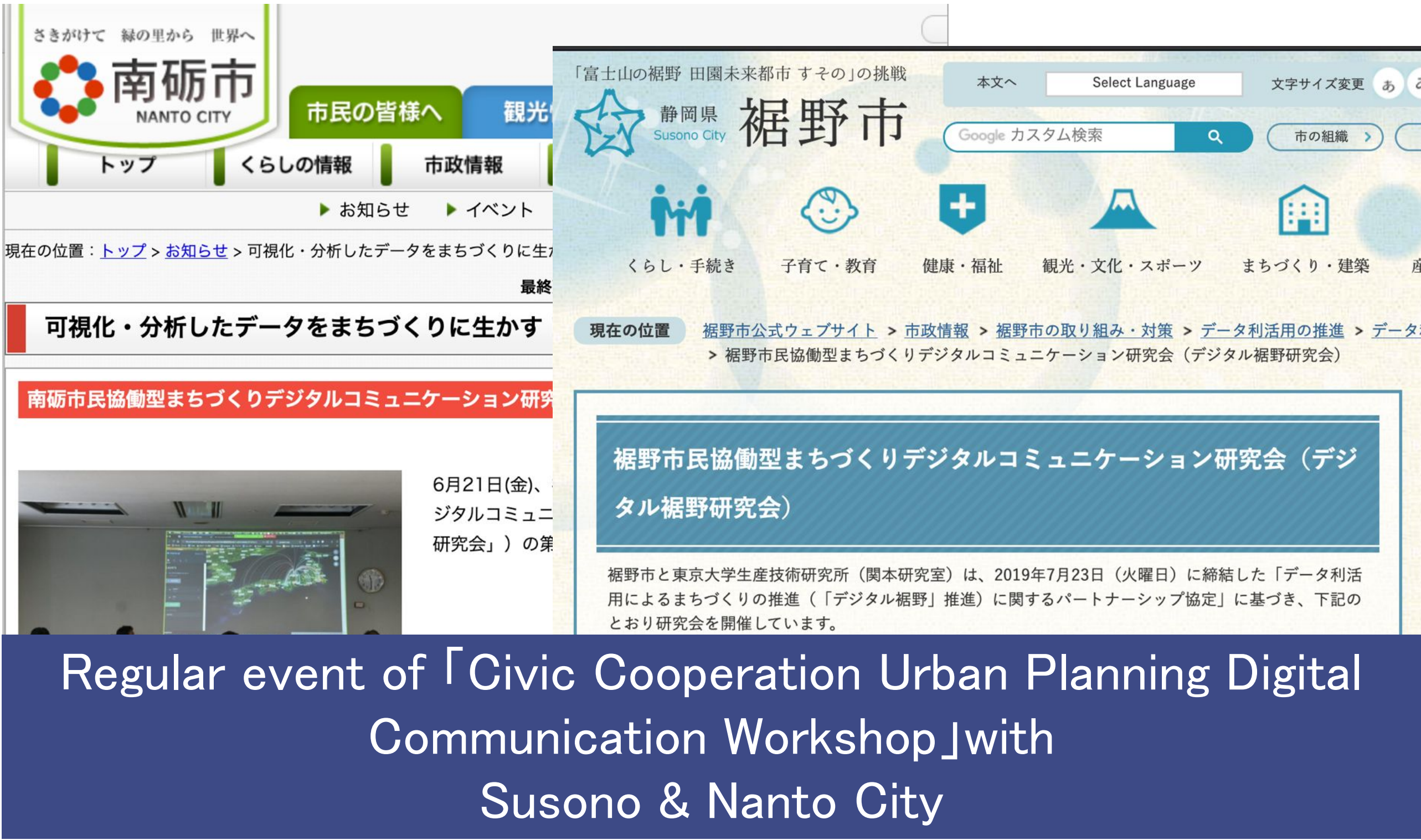
Regular event of 「Civic Cooperation Urban Planning Digital Communication Workshop」with Susono & Nanto City