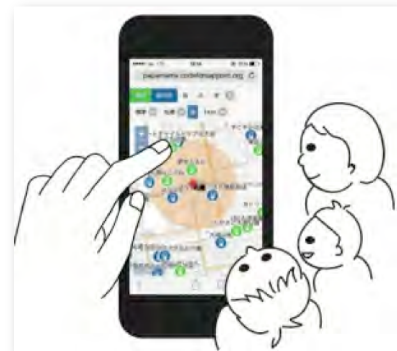
Gold Prize of 2014 • Sapporo Childcare Map http://www.codeforsapporo.org/category/projects/

Phase 1 of 2014, set the 10 regional offices in each prefecture, gave the activities that make up the submissions through excavation and discussion of regional issues mainly of each region. In this year, we can spread the new activities to a total of 20 offices plus 10 bases !