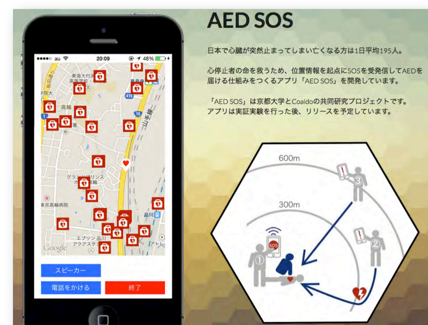
GOLD Prize of 2013 • AEDSOS http://aedsos.strikingly.com/

We held a workshop (Urban Data Challenge), the purpose of which was to promote participatory workshops with a data set that has been offered free of charge or with open geospatial data from local governments. Along with the discussion of regional issues in local government, this data set can help to solve urban problems.